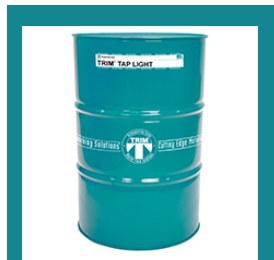
54-gallon drum SKU: TAPLT/54 UPC-12: 641238009191