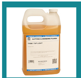
1-gallon jug SKU: TAPLT/1 UPC-12: 641238009139