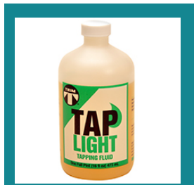
1-pint bottle SKU: TAPLT/PT UPC-12: 641238009221